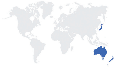
Japan, Australia and New Zealand (JANZ)